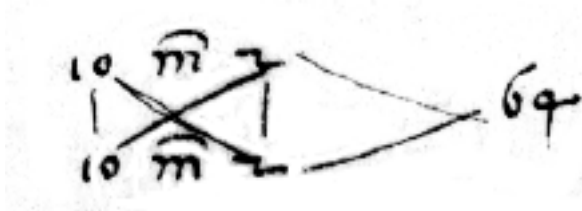
Fig. 1.1. Maestro Dardi's scheme for the justification of the rules of signs by cross-wise multiplication (from Chigi M.VIII.170 f.4 v ).

century. The reasoning goes as follows: we know that 8 times 8 makes 64. Therefore (10 - 2) times (10 - 2) should also result in 64. You multiply 10 by 10, this makes 100, then 10 times -2 which is -20 and again 10 times -2 or -20 leaves us with 60. The last product is (-2)(-2) but as we have to arrive at 64, this must necessarily be +4 . Therefore a negative multiplied by a negative always makes a positive. The strong belief by abbasco masters