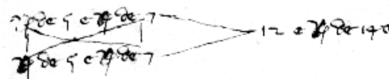
Fig. 1.0. Maestro Dardi's scheme for crosswise multiplication of surd binomials (from Chigi M.VIII.170 f.7 r ).

Here the multiplication of two fractional numbers 12\frac{1}{2} and 15\frac{1}{4} is surprisingly treated as the product of two binomials (12 + \frac{1}{2})(15 + \frac{1}{4}) instead of the product of two fractions \frac{25}{2} and \frac{61}{4} . In the pseudo-Paolo dell'abaco treatise, the author explicitly refers to the two methods, one by multiplication of binomials and the other as a multiplication of two fractions [1, p. 28]. We therefore understand the method of multiplying binomials as a general procedure for multiplying all kinds of entities that can be expressed as binomials. It suffices to identify the elements of the two binomials in the crosswise diagram to justify the method. We thus find it applied to the multiplication of surds and the multiplication of polynomials. As shown in the figure above, Maestro Dardi uses the crosswise